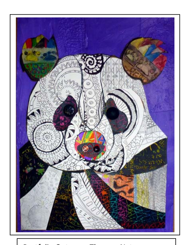
Portfolio Outcome Theme : Nature