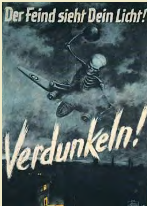
A poster published in Germany in 1943. The caption means 'The enemy sees your lights! Blackout!'