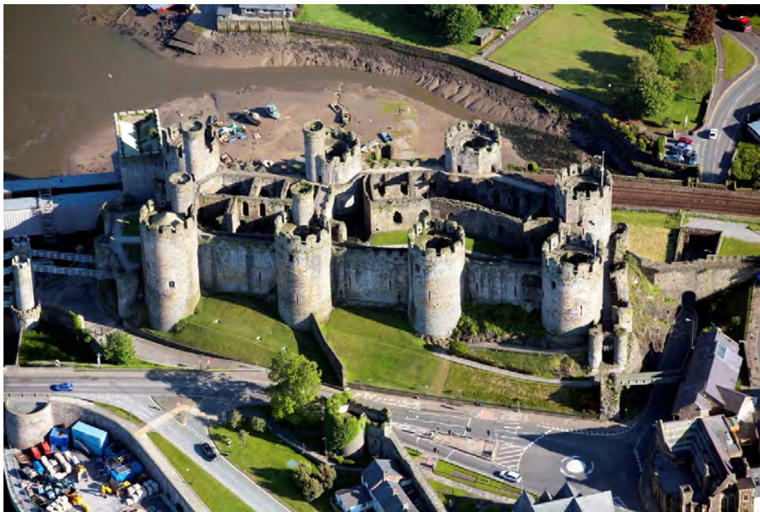
An aerial photograph of the remains of Conwy Castle in North Wales