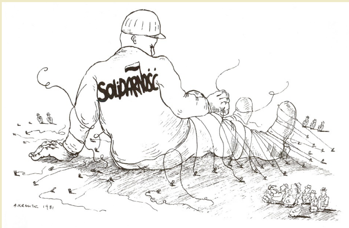
A cartoon by Polish cartoonist Andrzej Krauze, printed in 1981. (Solidarność = Solidarity)