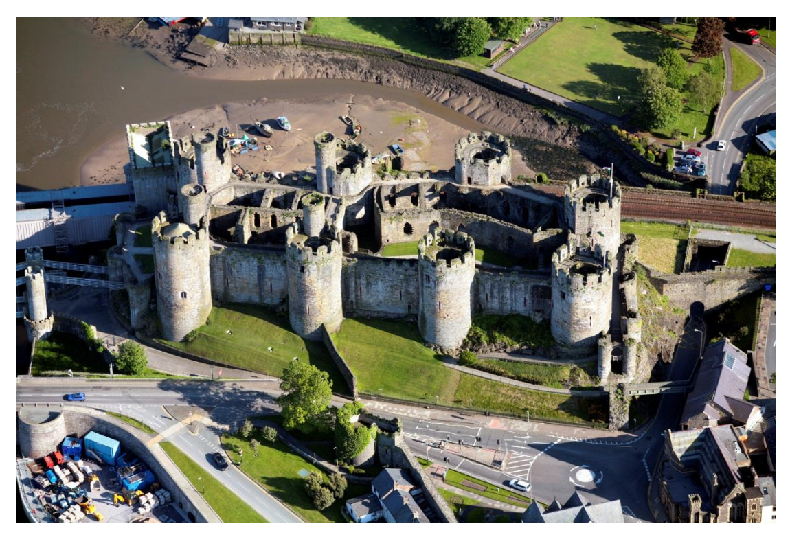
An aerial photograph of the remains of Conwy Castle in North Wales.